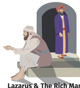
Lazarus & The Rich Man