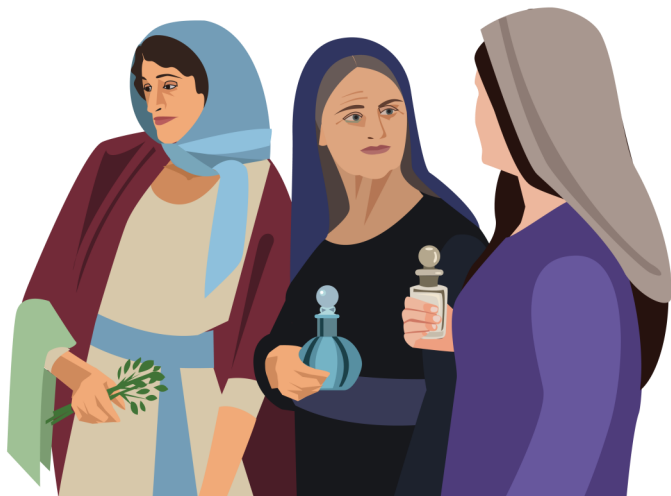
The Women Bring Spices to Jesus' Tomb