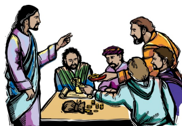
The Calling of Matthew