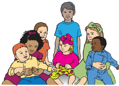
Nursery Workers Needed

We are looking into re-opening the Nursery soon.