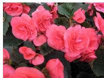
Million Bells Hanging Pot

Begonias are $20. each and the Million Bells are $24. each.